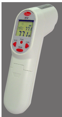
412 Gun-style Infrared with Thermocouple Jack