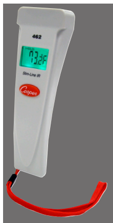
462 Slim-Line Infrared