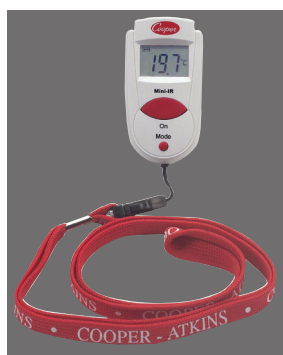
470 Mini Infrared