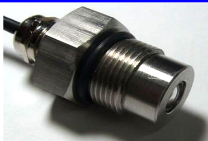
Fig1. UV Sensor Probe