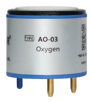
Figure 1. AO-03 Oxygen Sensor

AO-03 oxygen sensor is widely used in the fields of mining, steel manufacturing, petrochemical and air monitoring. For example, it can be integrated into oxygen alarms in mines, air quality detectors and commercial air purification equipment. The data provided in this document are valid at 20°C, 50% RH and 1013 mbar for 3 months aftert the manufactured date of sensor. Please strictly follow the instructions for operating the oxygen analyzer and replacing the oxygen sensor.